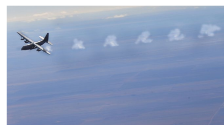
A conservation easement adjacent to Melrose Air Force Range consists of 30,493 acres (top). An AC-130W Stinger II fires its weapon over Melrose Air Force Range, N.M (bottom).